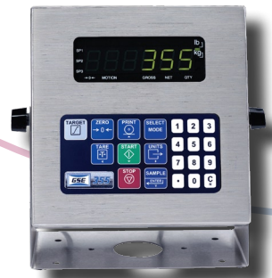
Safe Area Hub: Model 355 Indicator