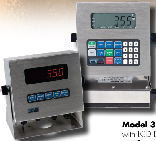
Model 355 I.S. Indicator with LCD Display, and Battery Module